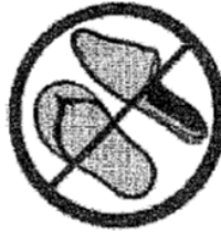
No Slippers / Strapless Sandals