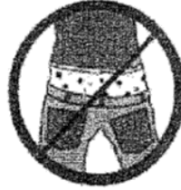
No Sagging Pants