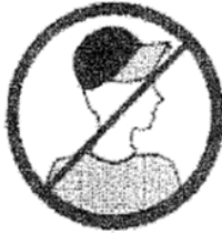
No Baseball Caps Indoors