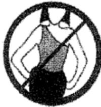
No Single Shoulder Tops