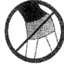
No Mini Skirts