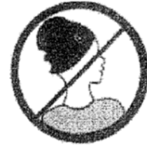
No Beanies Indoors