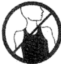
No Tank Tops / A Shirts