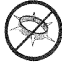
No Spiked Jewelry