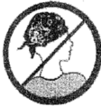
No Bandanas/Head Scarves