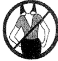
No Low-Cut Tops