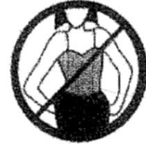
No Spaghetti Strap Tops