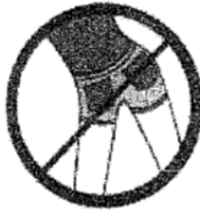
No Short Shorts 3 inches above the knee