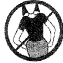
No See Through Tops