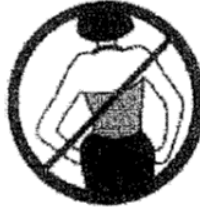
No Halter / Backless Tops