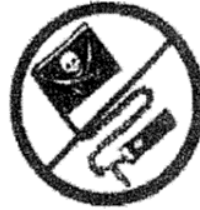
No Wallet Chains