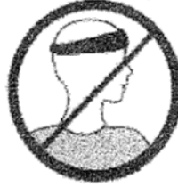
No Head Bands