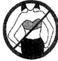
No Tube Tops